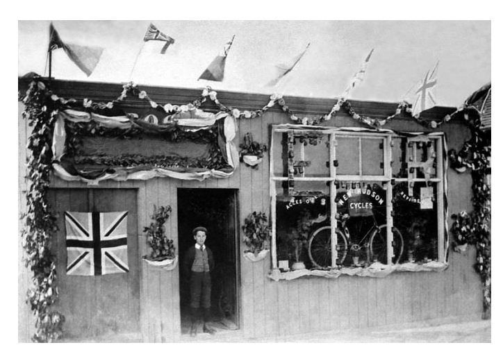
Rooke's shop near Abbey Mill in 1907

An archaeological survey at the time shows that the site has been occupied since the Mesolithic period and interesting artefacts such as a costrel (a kind of medieval flask) were discovered.